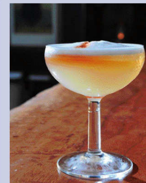
Imperial Grand：Marshall Altier的得意創作，口味偏甜，橙香豐盈。