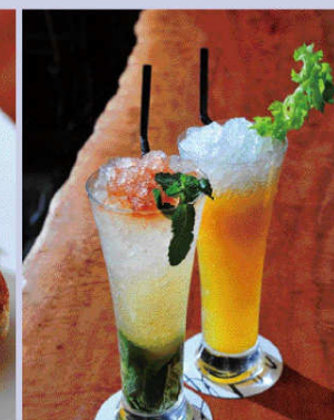
Queen's Park Swizzle（前）、Happy Valley Swizzle（後）：前者猶如Mojito變奏，感覺清新；後者香料味道突出，口味獨一無二。

While the design certainly makes a visit to this place worthwhile, there is also a top quality selection of drinks on offer with some decent food offerings as well. These include liquid concoctions thought up by New York mixologist Marshall Altier and a wine list conjured up by local sommelier Ringo Lam. Available are also two-course lunch sets and an all-you-can-eat dim sum option which uses no MSG. 今